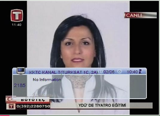
SCPC reception via TURKSAT 42° East