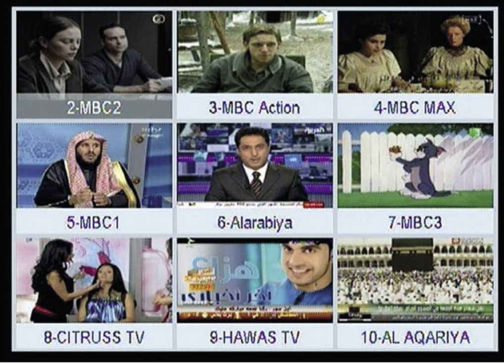
Multi-picture view with 9 channels

channel search for one or several satellites or a manual transponder search. For both modes you can restrict the search to free-to-air only, TV only, radio only or TV & radio. Network search can be activated if required.