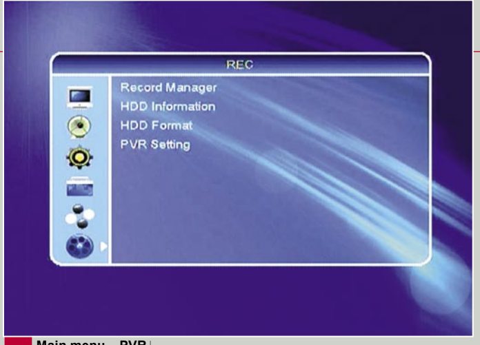
Main menu - PVR