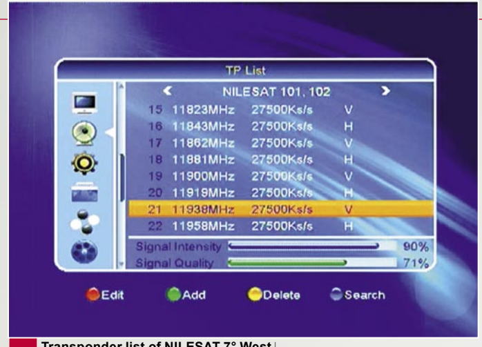
Transponder list of NILESAT 7° West

The 3000CRCI sports a 4000-channel memory and in order to fill it with offerings from the sky you may want to either perform an automatic